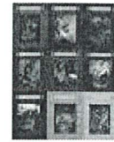
The Sisters Grimm Michael Buckley