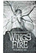
Wings of Fire Tui T. Sutherland