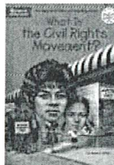
What is? Series Various authors