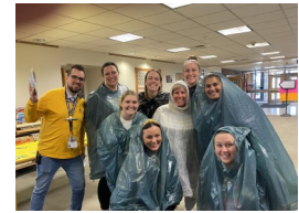
Glenolden staff who volunteered to get pied!